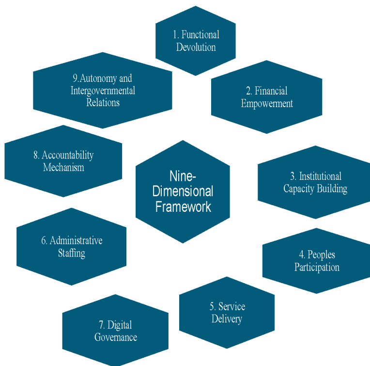
Figure 1: Nine-Dimensional Analytical Framework

capacity and digital governance data from NIRDPR (2022–23), accountability and fiscal trends from the Standing Committee Report (2025), and empirical studies on PRI functioning and service delivery (JRD Karnataka Study, 2018; IJAR, 2024) are important data sources. Evidence on marginalised communities and welfare implementation is integrated using sectoral studies, such as MGNREGA’s impact on Scheduled Tribes (Keshlata & Fatmi, 2015)